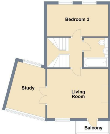
First Floor Approx. 42.2 sq. metres (454.4 sq. feet)